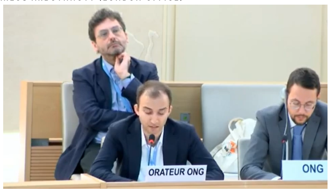
Interactive Dialogue with the Working Group on Transnational Corporations and Other Business Enterprises